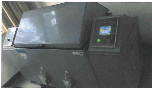
试验中/During the test